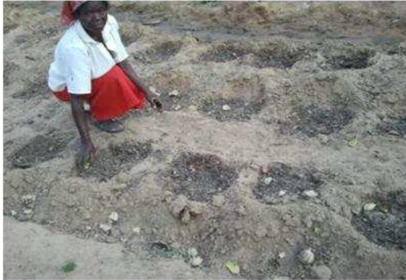
Figure 1. Maize production by smallholder farmers in Makoni District in Zimbabwe.

composts as basal dressing in the planting basins. CF is thus a part of conservation agriculture as the other principles of conservation agriculture are not being precisely carried out. These other principles are; mixing and rotating crops, timely implementation of farming operations, precise operations done completely and efficient use of inputs as they are beyond the capacities of some of the small holder farmers. In Zimbabwe CF has been promoted by relief and development agents in an attempt to ensure that food is available at household level (Hove et al., 2011). CF has been tested and promoted as one of the interventions for addressing the prevalent problems of food insecurity, environmental degradation and poverty among the region's rural communities. The promotions began in 2003 aimed at bringing Zimbabwe out of the food deficit zone which was made worse by the 2002 drought and the changing rainfall patterns. CF is regarded as a medium term strategy to achieve increased yields and ensure food availability at household level. Benefits such as increase in yield, reduced soil erosion and improved soil fertility have been noted by the farmers using the farming method (Twomlow et al., 2006).