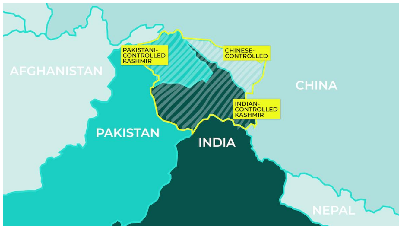
Figure 1 shows the Map of Kashmir.

Ladakh is a Union Territory of India located to the east of Azad Jammu and Kashmir and Gilgit-Baltistan, sharing a border with both regions to the west. To the north, Ladakh shares a border with China-administered Aksai Chin.